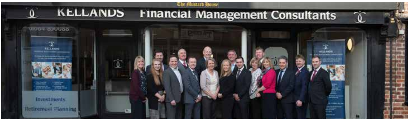
Pictured: The team at Kellands Gloucester.